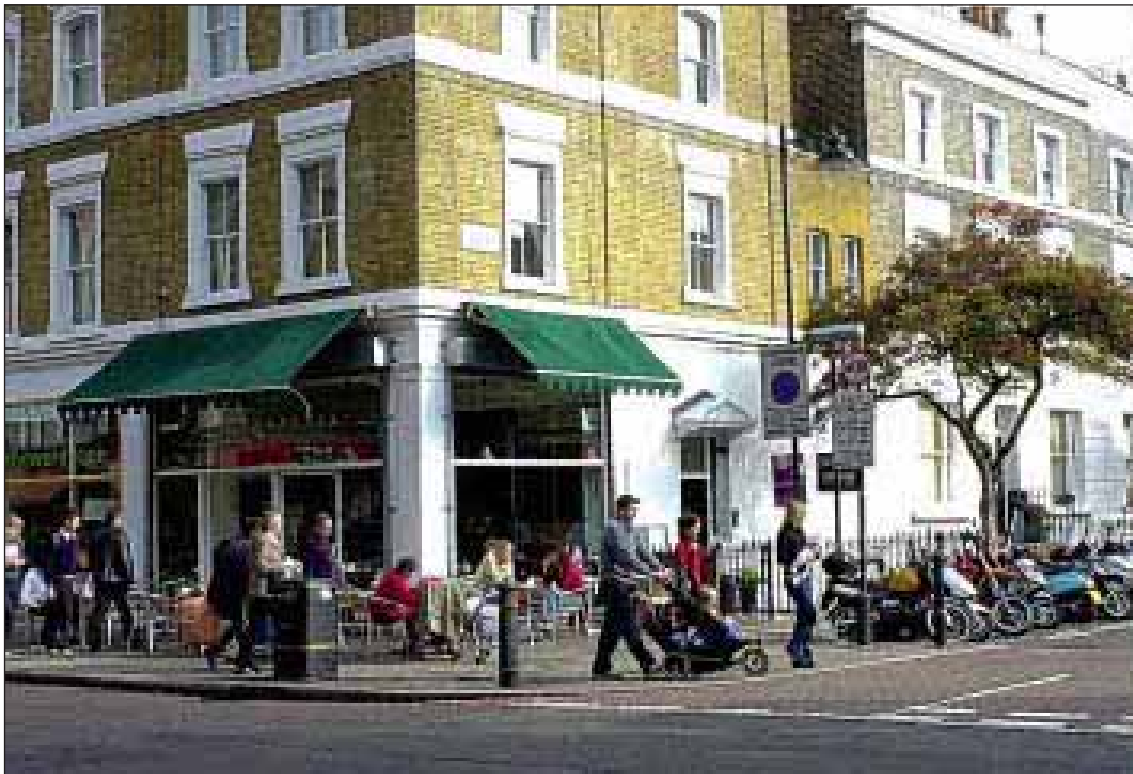
Café society: there is a wide range of places in which to find something to eat and drink in nearby Upper Street, Islington