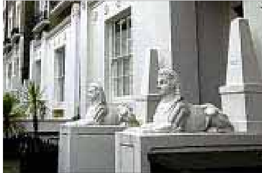
Exotic: sphinxes outside a house in Richmond Square