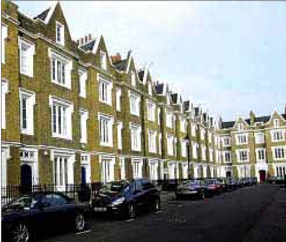
Character building: squares such as Cloudseley have their own distinctive style that adds appeal